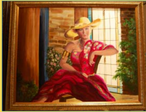
Artwork by Priscilla Silverberg