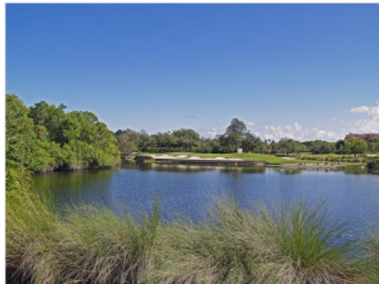
Share Broken Sound Club, Florida