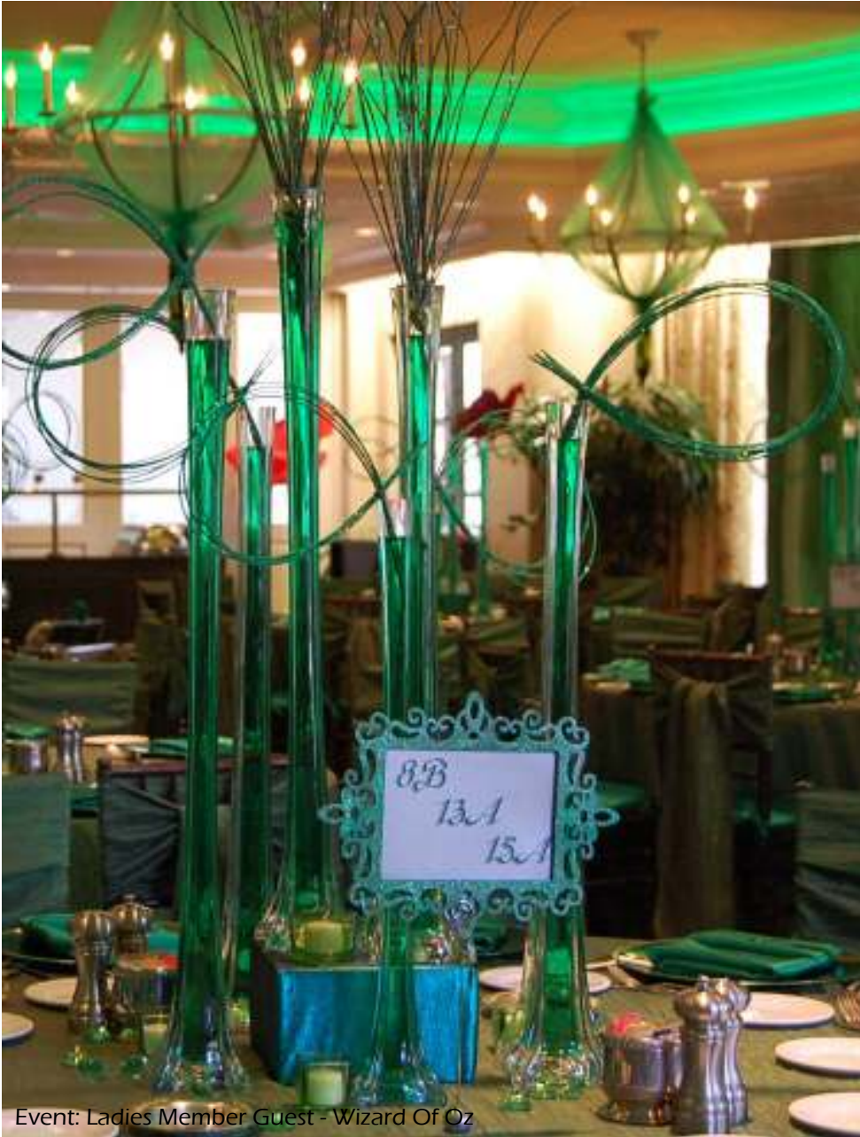
Event: Ladies Member Guest - Wizard Of Oz