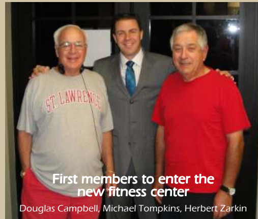
First members to enter the new fitness center